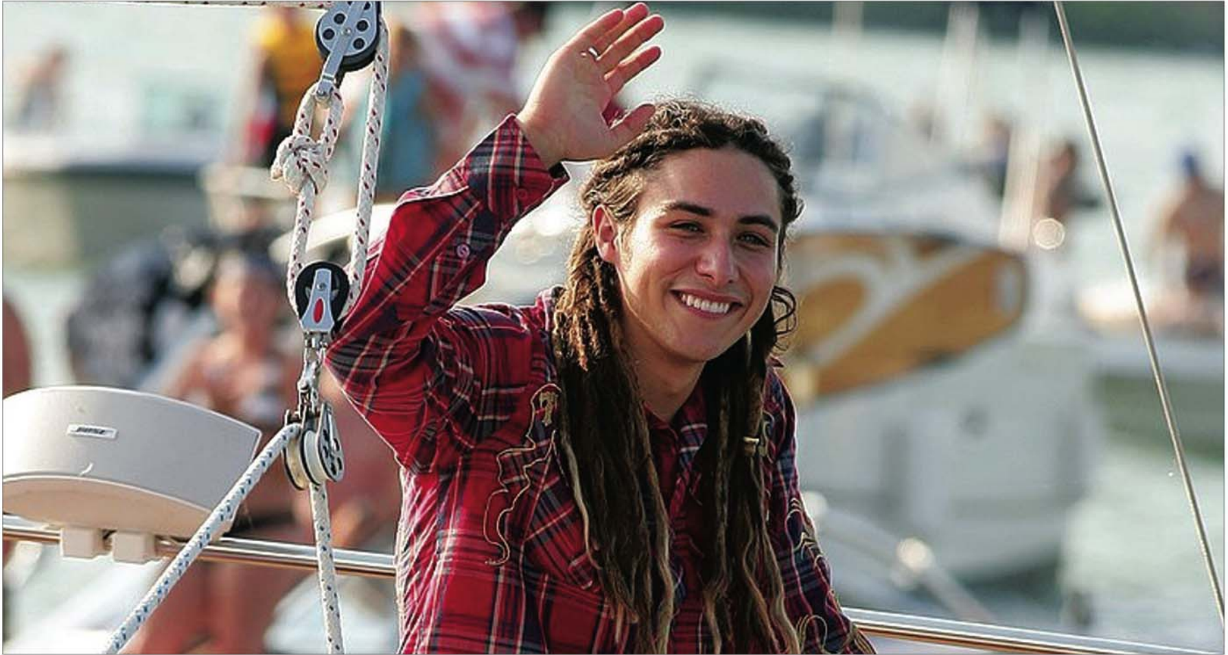
neighborsgo • Rockwall • Rowlett